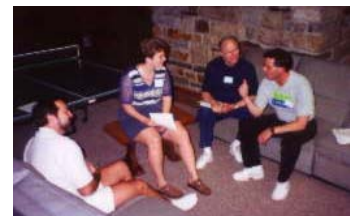
Small group work is an important part of the Leadership in Ministry Workshop learning process.